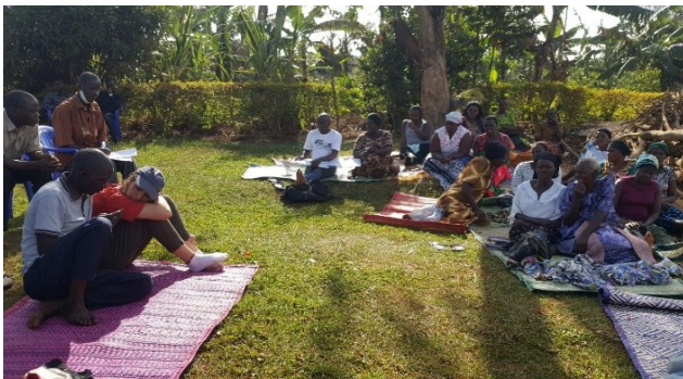
Community Engagement Meetings