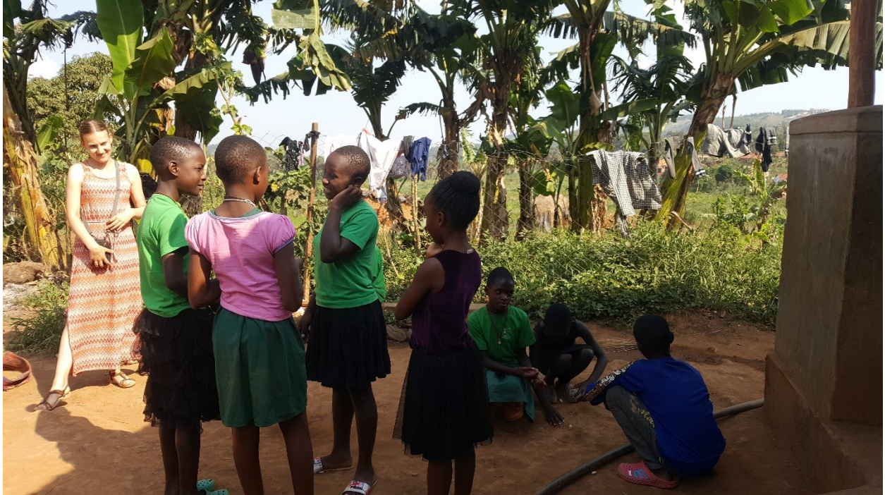
A drama group in Happy Totos doing a drama