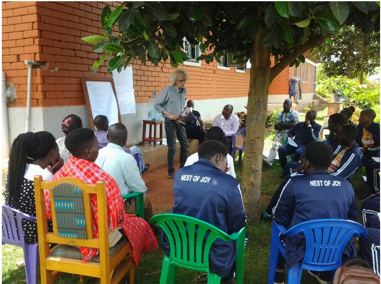
A teachers' Workshop on Creating a good school