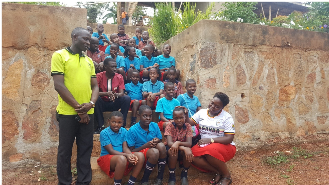
Nest of Joy Primary school at the Centre