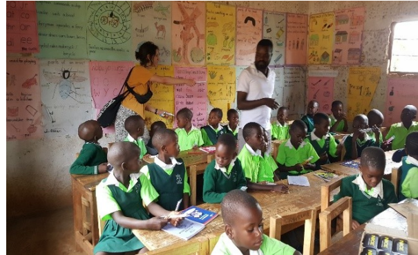
School pupils attending school.