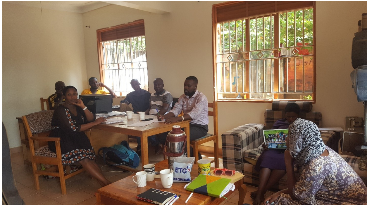
Staff Planning meeting