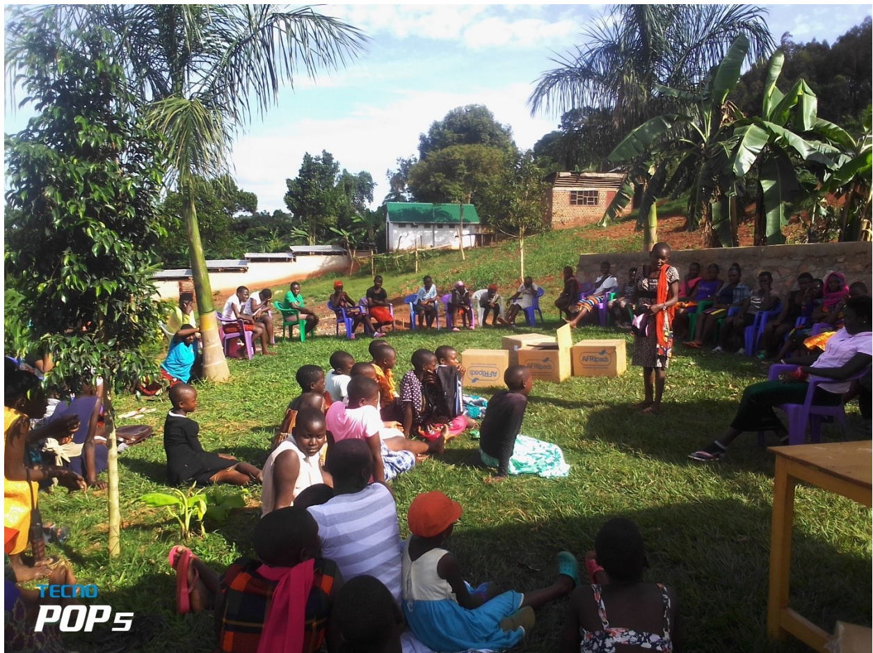
AFRIpads sanitary towels distribution