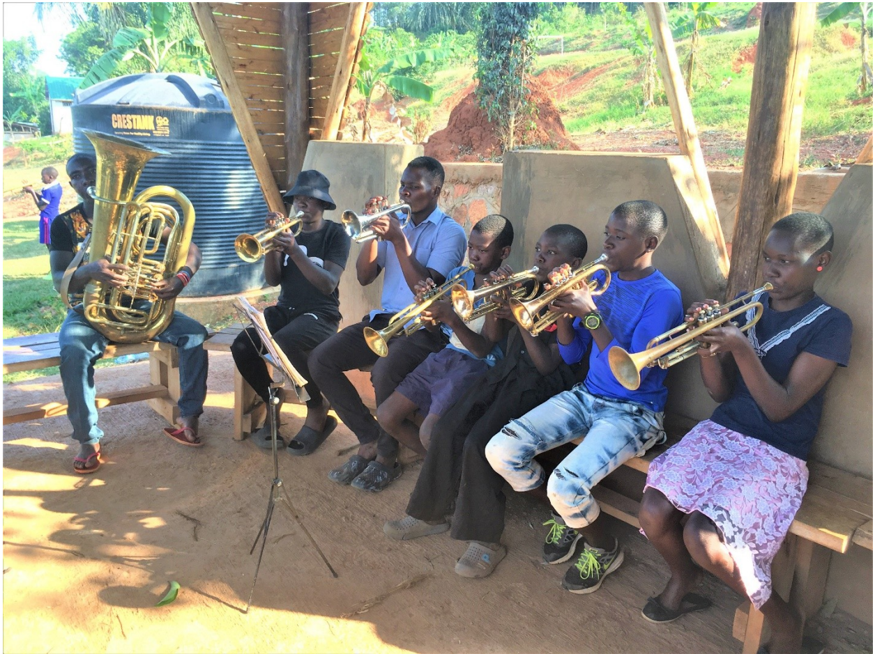
Brass band members in a training session