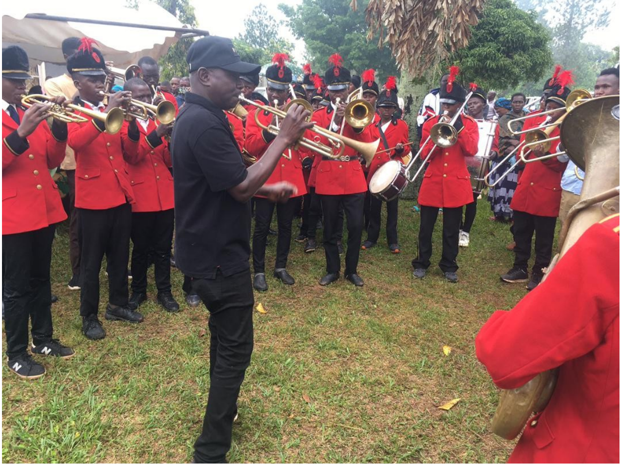
Brass band performing at a community event