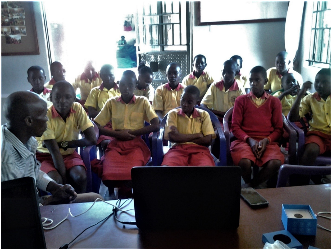
Pupils of Mivule Primary school during a Digital Exchange