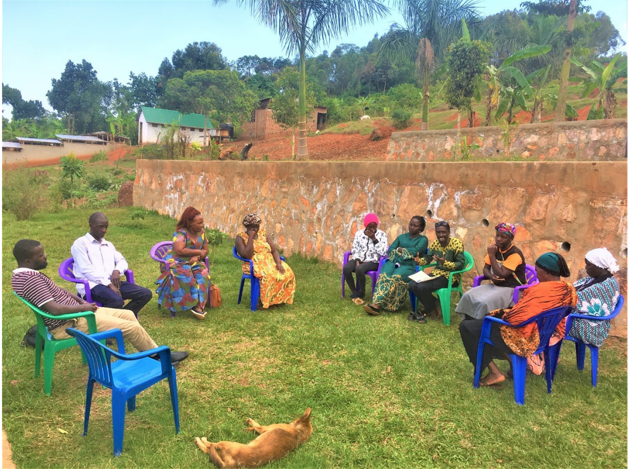
A seven member committee Team (Binkwatako Team) meeting