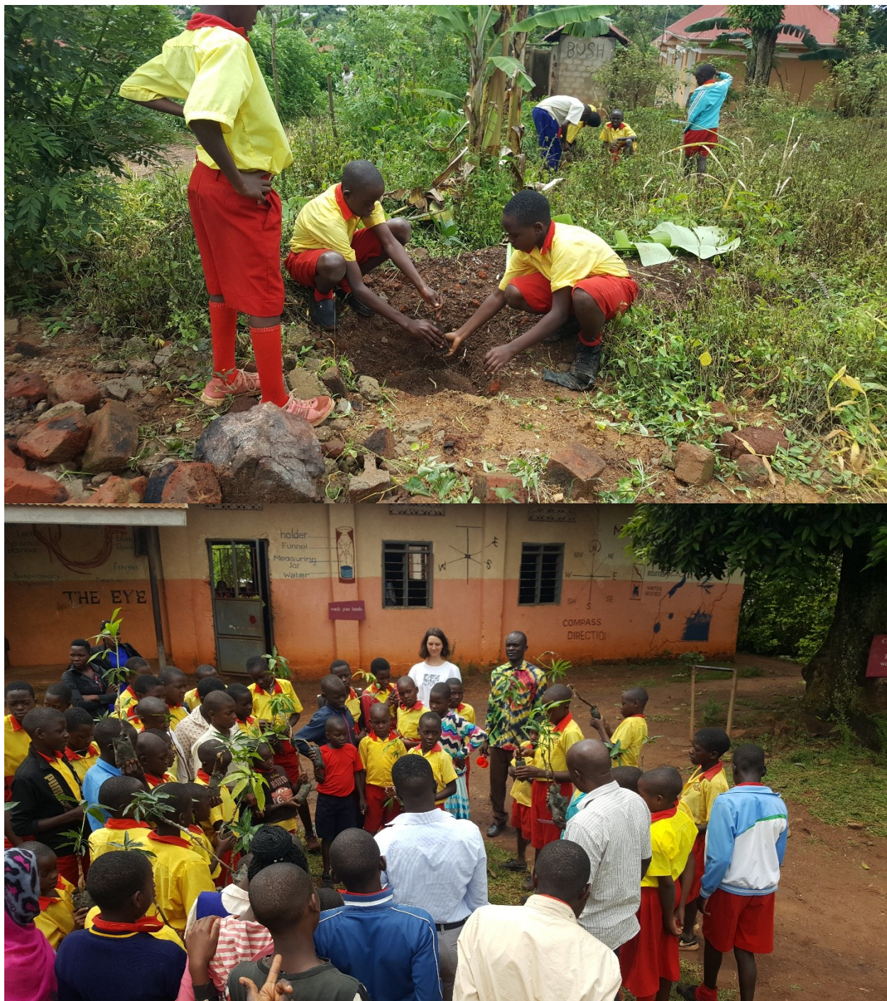
Climate Change and Tree planting Campaign